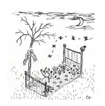
Illustration: Christina Nikolic

Protect container plants from root freezing by either moving them closer to the house, under the eaves or a deck, into a sheltered corner, or into a greenhouse or brightly lit garage. To give pot plants an extra layer of protection place one pot inside a bigger one and insulate the layer between with burlap bags or straw or shredded newspapers. And please don't forget to water them during the winter!